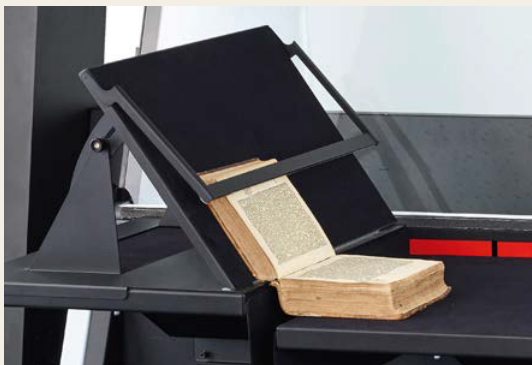
Bookholder on Copyboard OT 180 H 35 XL700