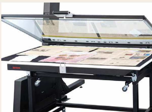
Toplight Table AT 0 with opened glass plate