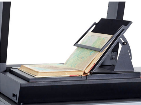
Bookholder on Copyboard OT 180 H 35 XL700