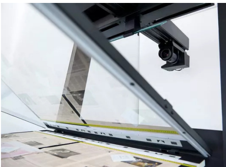
Toplight Table AT 0 with opened glass plate